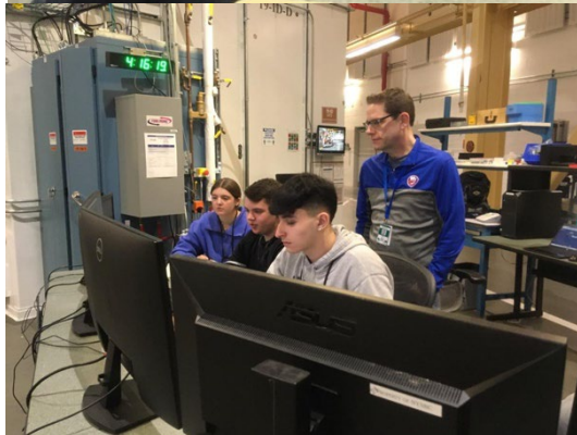
Spark Crystallography students at the AMX and NYX beam lines at NSLS II.

The SPARK program is hosted by BNL's Office of Educational Programs (OEP) in collaboration with the NSLS-II. This program provides an opportunity for high school students and their science educators to become visiting researchers at the Lab's scientific facilities— just like the thousands of scientific researchers that come here to carry out their research each year.