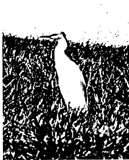
After a week at Brookhaven the Cattle Egret shows he has a neck, and can be dry and sleek.