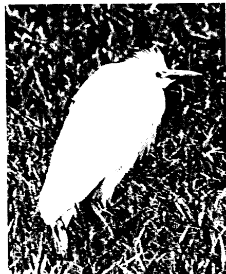
When this Cattle Egret first arrived at BNL he was soaked and dejected looking.

However, they seem to have no fears of cars, and will stay quite still if the photographer stays in his vehicle.