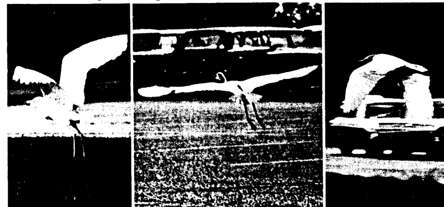
While on the ground the Cattle Egret looks at first glance to be a white chicken feeding in the grass. But when he takes flight, the grace and beauty of the Egret is apparent to all. The Egret is of the Ibis family, related to the sacred Egyptian bird. In his native Africa, the Cattle Egret can be found in great numbers in any field where large herds of hoofed animals congregate. Coming in for a landing after a flight over the Medical parking field, this Egret makes a beautiful picture. Most Lab employees hope that the Egrets will take up permanent residence on site. —Humphrey