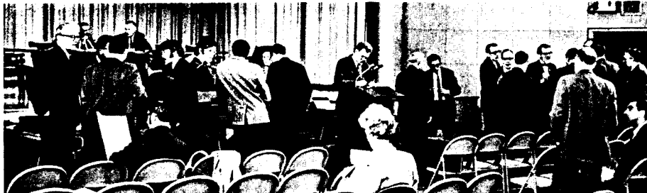
During a break in the Atomic Safety and Licensing Board hearing at Rocky Point School, groups of intervenors gather to plan strategy for the balance of the meeting. Public hearings on the granting of a construction permit to the Long Island Lighting Company will be held starting on May 25.