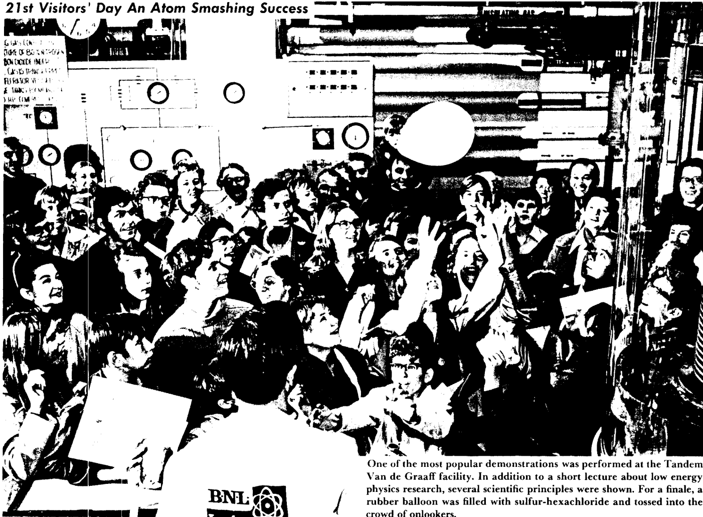
One of the most popular demonstrations was performed at the Tandem Van de Graaff facility. In addition to a short lecture about low energy physics research, several scientific principles were shown. For a finale, a rubber balloon was filled with sulfur-hexachloride and tossed into the crowd of onlookers.