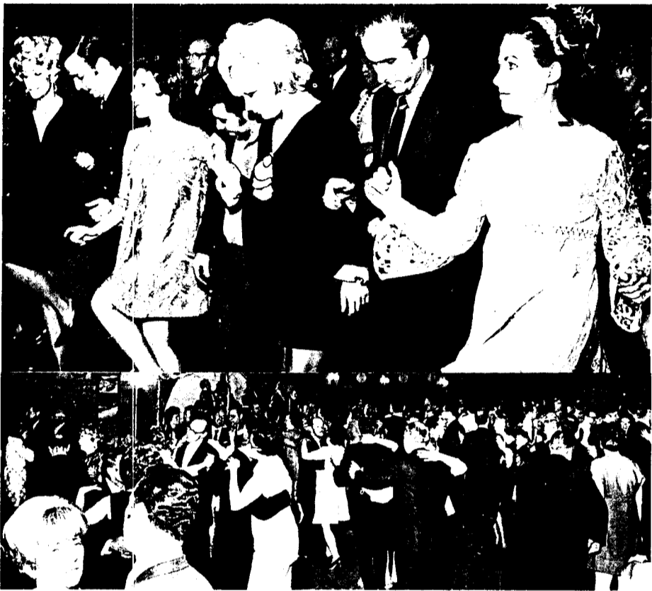
Alley Cat - waltz or what have you? The orchestra is ready if you are ready to dance tomorrow night from 9 p.m. when the Age of Aquarius starts at BNL.