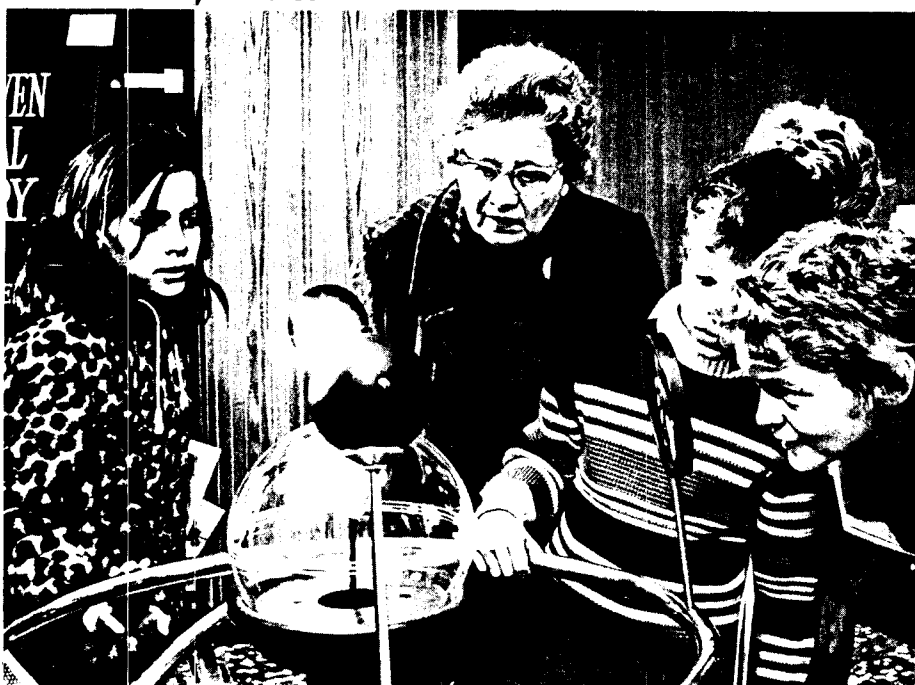
For the second year, a highlight of the display for Visitors' Day was the Lunar Sample exhibited in the lobby of the Chemistry Building.