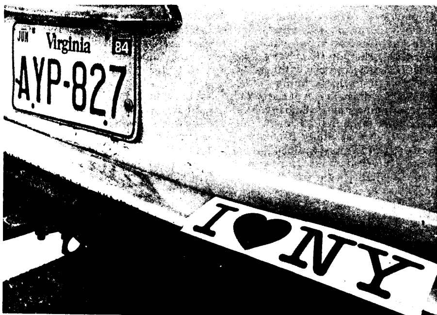
Virginia is for lovers, but Virginians love New York.

Some Hygrade all beef franks and Hygrade hot dogs are being recalled. Those in question have "sell by" dates of May 14, 1984, June 24, 1984, July 14, 1984 and August 22, 1984. The finding of wire pieces measuring one to four millimeters in length in the product has been confirmed by the USDA Emergency Programs Office.