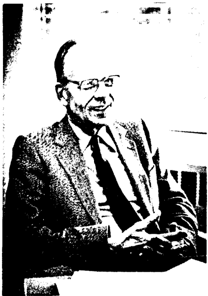
Leon Van Hove