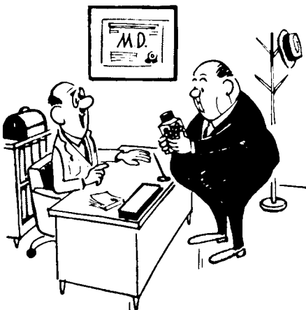
"YOU DON'T EAT THEM. JUST SPILL THEM ON THE FLOOR THREE TIMES A DAY AND PICK THEM UP ONE AT A TIME."

To reserve a ticket, send your fare through the U.S. mail to BNL, P.O. Box 322, Upton, New York 11973. Checks or money orders should be made payable to BNL. Do not send cash. Put the date of the trip, your telephone number and BNL life number on the check. Tickets will be given to you on the train.