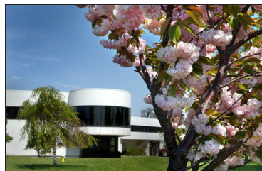
Brookhaven's National Synchrotron Light Source

One of the world's most widely used scientific research facilities, the National Synchrotron Light Source (NSLS) is host each year to 2,100 researchers from more than 400 universities, laboratories, and companies. Research conducted at the NSLS has yielded advances in biology, physics, chemistry, geophysics, medicine, and materials science.