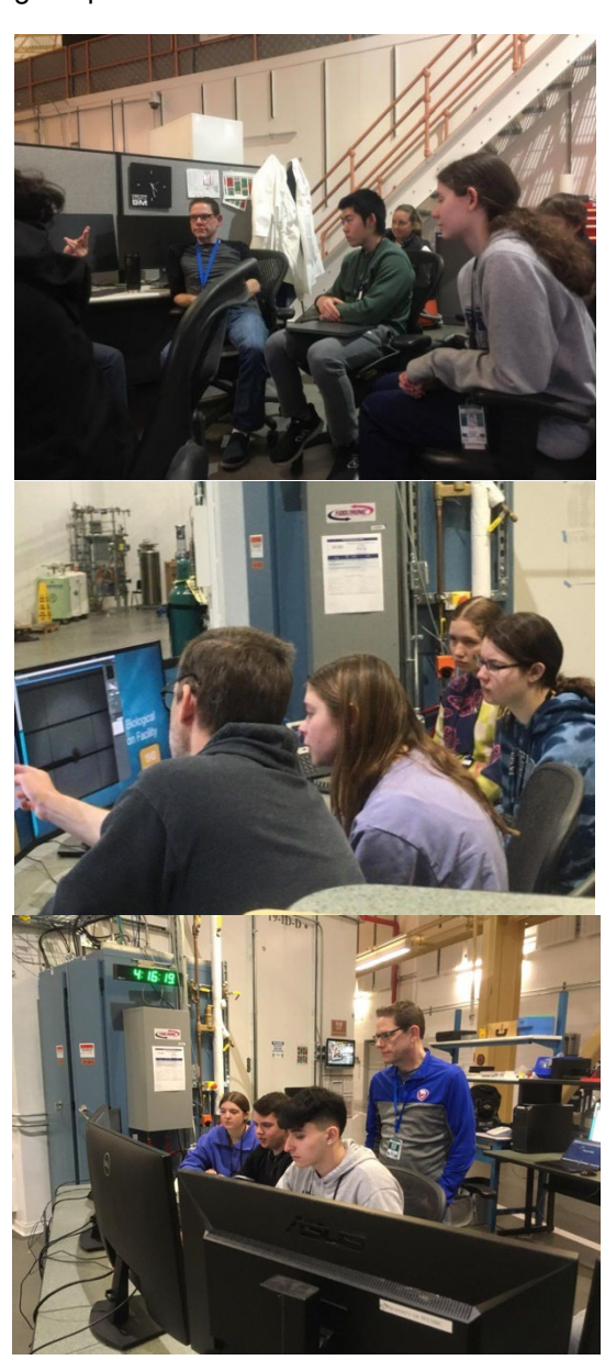
Spark Crystallography students at the AMX and NYX beam lines at NSLS II.

The Student Partnerships for Advanced Research and Knowledge (SPARK) program is back in person at NSLS II! Starting cycle 2023-1 (January through March 2023), high school science educators and their students visited several beamlines at the NSLS II in person to carry out their research after a long-time collecting data remotely during the pandemic.