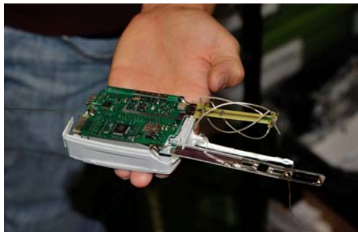
Radiosonde (sensor attached to a weather balloon that makes measurements and relays information). They don't work as well after hitting containers.

MAGIC continues into Leg04A, and the Spirit should arrive in Honolulu tomorrow night. Actually, it will be early in the morning, my time, this Thursday. I mentioned in my last update, from Honolulu, that I had been more than a bit confused with time zones, time changes, etc. A friend here at work pointed out that I had stated in the update that it was Tuesday, October 10, 2012, but Tuesday was October 9. I rest my case – confusion reigned. In trying to decipher how I could have made such a glaring mistake, I came up with the following scenario. I was writing that section of the update on Tuesday (local time) in the evening and looked at my computer to give the date. My computer was set to UTC (formerly Greenwich Mean Time), for which it was already Wednesday, and the date shown on the screen was the 10 th . As one of my coworkers once quipped, “Time is a pain in the ***.” I couldn’t have said it better myself.