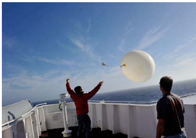
Brett launching a balloon and radiosonde as Pat looks on.

Being back on shore has been a bit difficult; there are a few hundred emails to catch up on, phone calls, mail and bills to deal with – all that “real world” stuff that has to be done. I suppose one must always pay for their fun. Some of the catch-up has been enjoyable, though; specifically, sorting through the pictures that I took while on board. A few are attached.