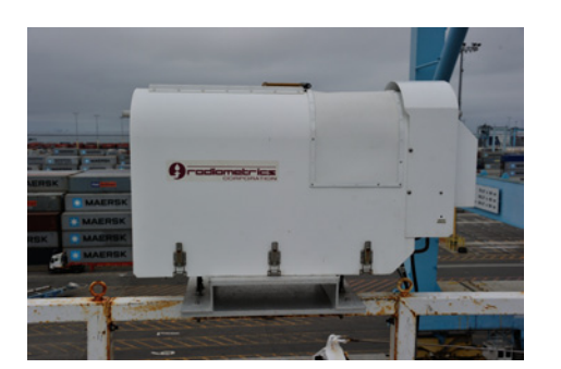
Microwave radiometer (known as "the mailbox")