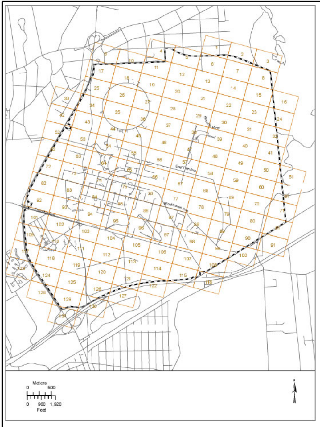
Figure 7-1. BNL Grid Map.