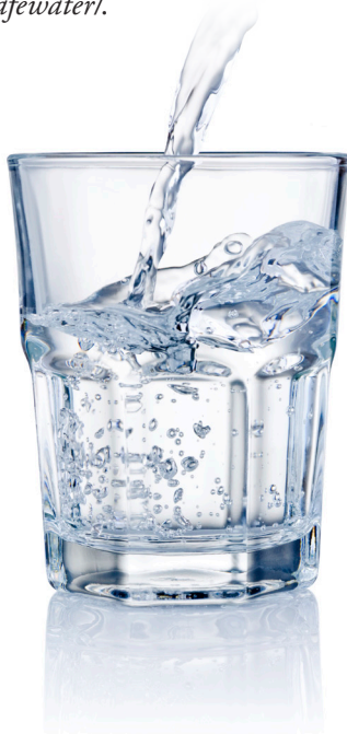
2012 Lead and Copper Sampling Results

Information on lead in drinking water, testing methods, and steps you can take to minimize exposure is available from the Safe Drinking Water Hotline (1-800-426-4791) or at http://www.epa.gov/safewater/ .