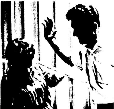
What's brawn against a little brains and a lot of talent?