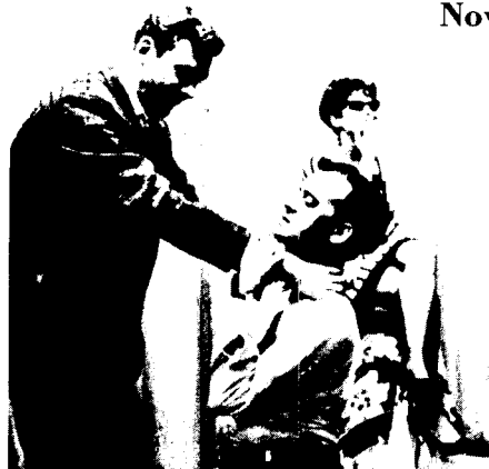
All right, Harry, she isn't stupid.