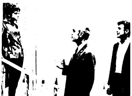
For something like that I don't need a drink.