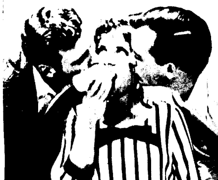
Now food for body, later food for soul.