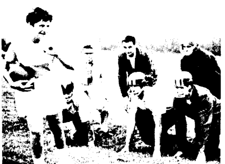
Billie Dawn bootlegs the ball as she practises an end run. As usual, the Born Yesterday star is about to be pursued by men.