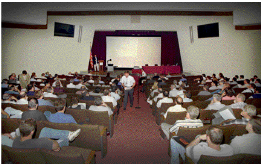
Close to 400 employees attended the security stand down in Berkner Hall on Tuesday, August 3.