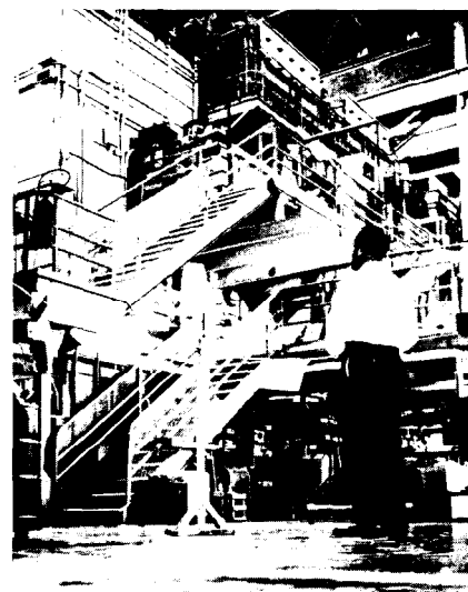
View from new Observation Area at Reactor.

The schedule of routine shut downs of the BNL Reactor for service and maintenance has been changed from alternate Saturdays to alternate Fridays. Since these activities necessarily limit access of visitors, it is urged that visits to the Reactor be made on non-shut down work days.