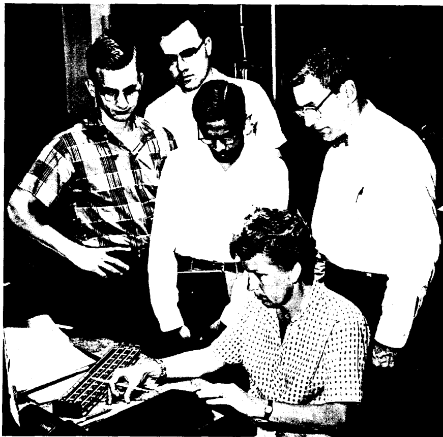
Personnel monitoring supervisor and assistant demonstrate film badge techniques for A.E.C. Health Physics Fellows.

In recent years, students throughout the world have been learning a fourth "R" in addition to the familiar "reading, 'riting, and 'rithmetic". The fourth "R" is radioactivity. The need for training individuals in the use and hazards of radiation was apparent immediately after Becquerel's discovery of radioactivity in 1896 and is becoming more important with each passing year.