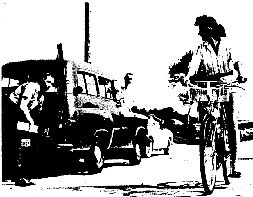
The Laboratory's new fleet of bicycles has become a very popular mode of transportation on site. There are 40 of the bikes at the present time.