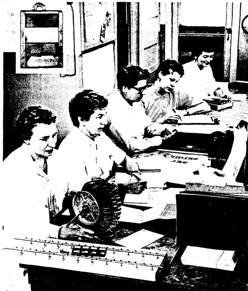
Part of the Personnel Monitoring Group processing film badge data. In the insert is a photo of a visitor's film badge.

The Personnel Monitoring Group of the Health Physics Division, which includes nine people, is responsible for measuring and recording the radiation exposure of all persons at Brookhaven. The major part of the work involves the film badge service. Film badges are assigned, collected and processed, and records are kept for every person entering into or working in a radiation area. This operation is necessary in order to provide records for the control of radiation exposures of all individuals.