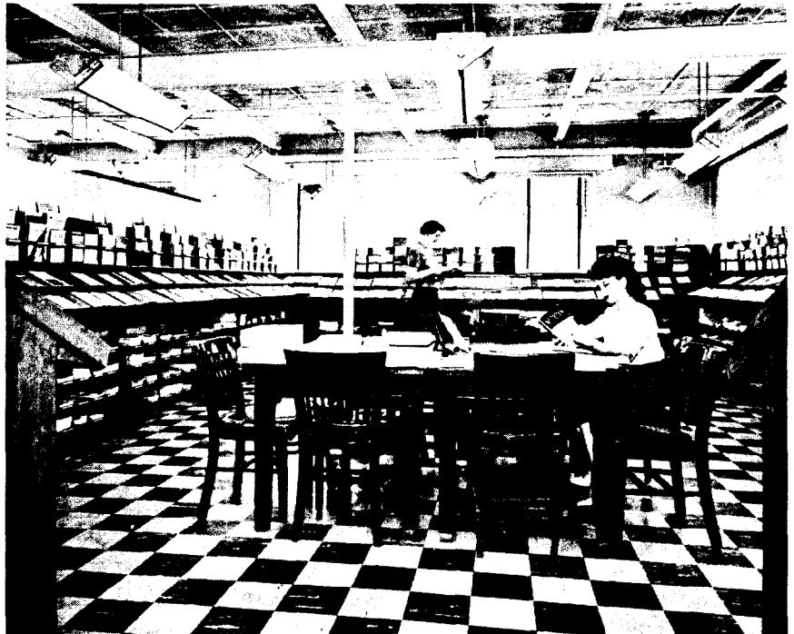
Periodical room of the Research Library.

A reasonably accurate description of the Research Library is that it is the Laboratory's supermarket of scientific information. It reached the size of a supermarket in the early years of Brookhaven National Laboratory, when loads of knowledge arrived by the truckful. This rapid build-up was deliberately planned, so that newly arrived staff members could do the literature research that was required before engaging in their particular projects.