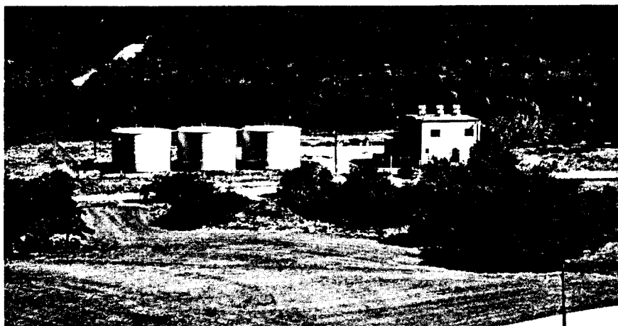
Waste Concentration Plant on right, above-ground tanks for temporary storage of "D" waste on left, looking north from top of Reactor Building. Fifth Avenue is in center of picture. Permanent storage tanks for "B" waste are out of sight below ground behind the "D" tanks.

Liquid waste is generated principally at the Graphite Research Reactor and at the Hot Laboratory. From each of these locations the waste is piped in stainless steel systems to the Waste Treatment Area located in the northwest corner of the Hot Laboratory Building. Lesser amounts of contaminated liquid waste are also generated in some of the labs of the Chemistry, Biology, and Medical Departments and are brought by tank truck to the Waste Treatment Area where they are pumped into the appropriate tank and mixed with the other piped wastes. Waste coming from the Reactor comes principally from the fuel storage canal under the Reactor, although there are drains in the laboratories which also are connected to the "hot" pipe system running over to the Hot Lab.