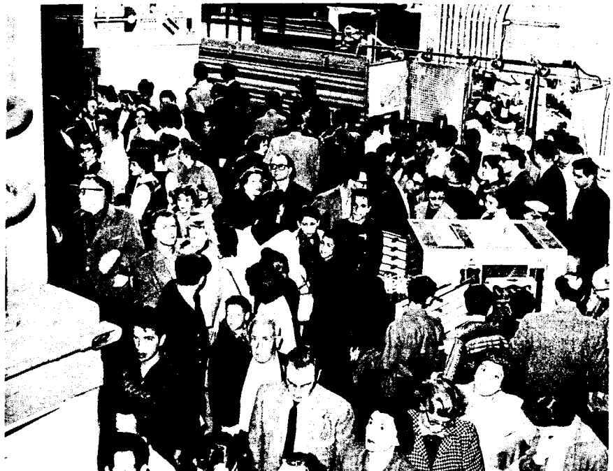
Typical Visitors' Day scene. This was taken last year at the Reactor and will probably be repeated on Saturday, October 21st (Visitors' Day for general public).

V Day is just ahead of us. Saturday, October 21st, will be the day for the general public to see all that goes on at BNL. College Visitors' Day will be Friday, October 27, from 9:00 A.M. to 5 P.M., and high schools will be on site Saturday, October 28th.