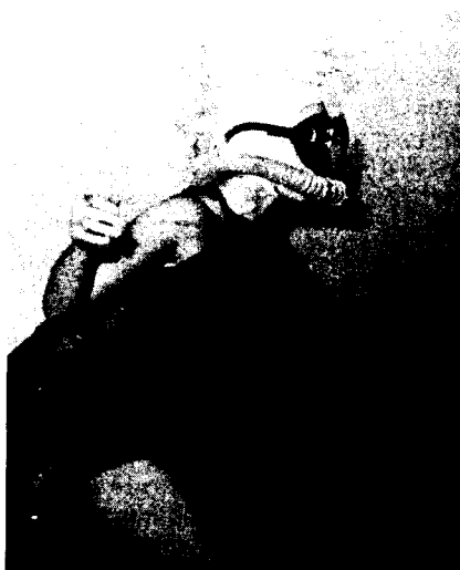
The above picture was taken by a home-made underwater camera constructed by a member of the Skin Diving Club.

The definition of SCUBA is "Self-Contained Underwater Breathing Apparatus," better known as Aqualungs. Have you ever wondered what it's like to see the world from a fish's eye view? If so, you will have your chance to try Scuba diving at the Second Annual Open House to be held by the Brookhaven Divers Club on Monday, October 30, 1961 at 8 PM in the Pool.