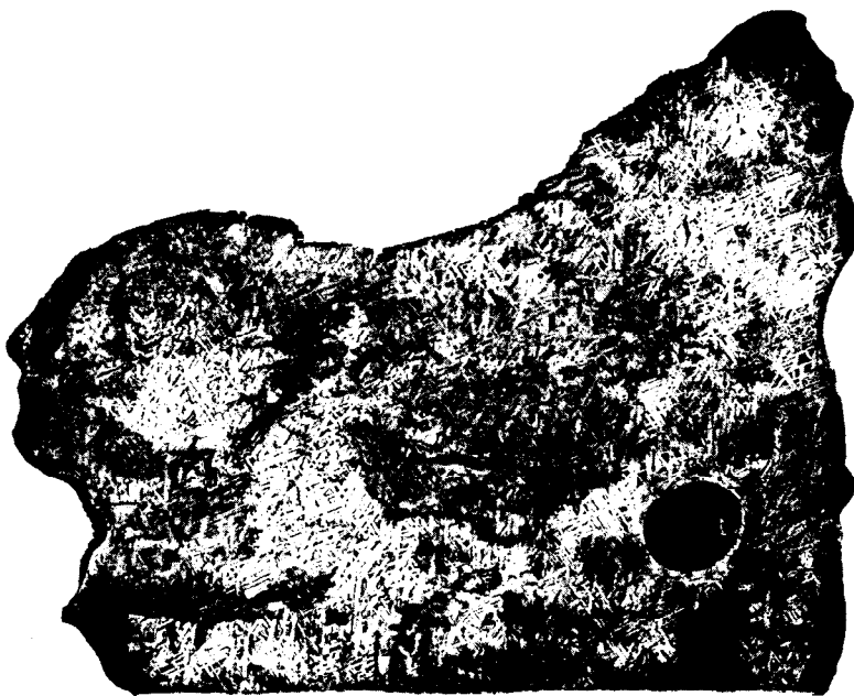
The scarred face of the Treysa Meteorite yields information about outer space.