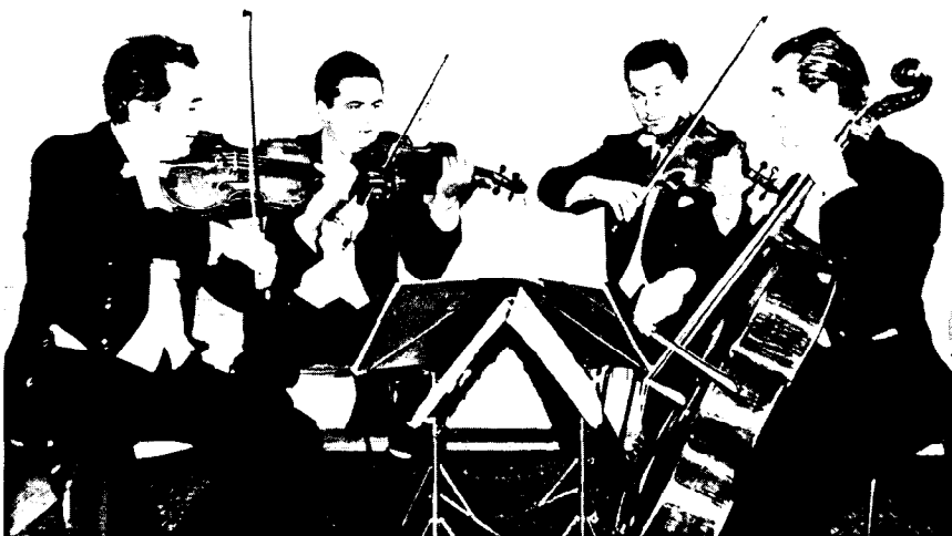
The Drolc String Quartet

Brookhaven Center Admission $3.00 Thursday, March 29 8:30 p.m.