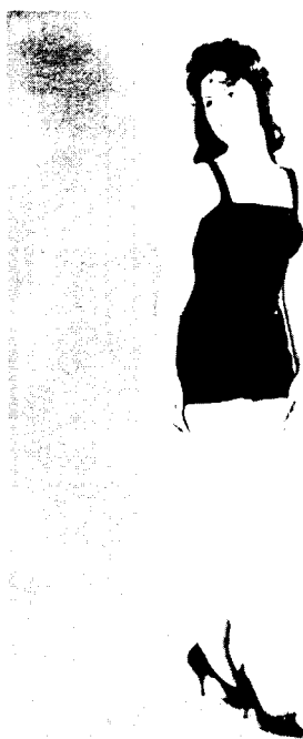
Miss BNL 1961