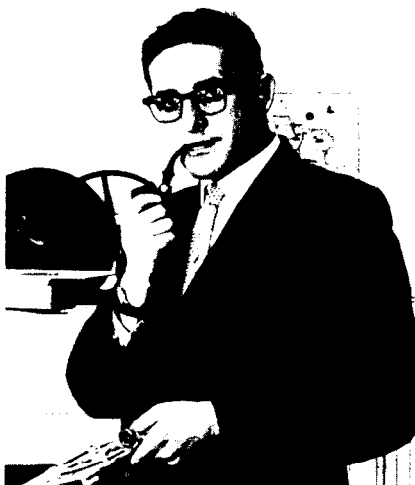
Professor Derek J. de Solla Price