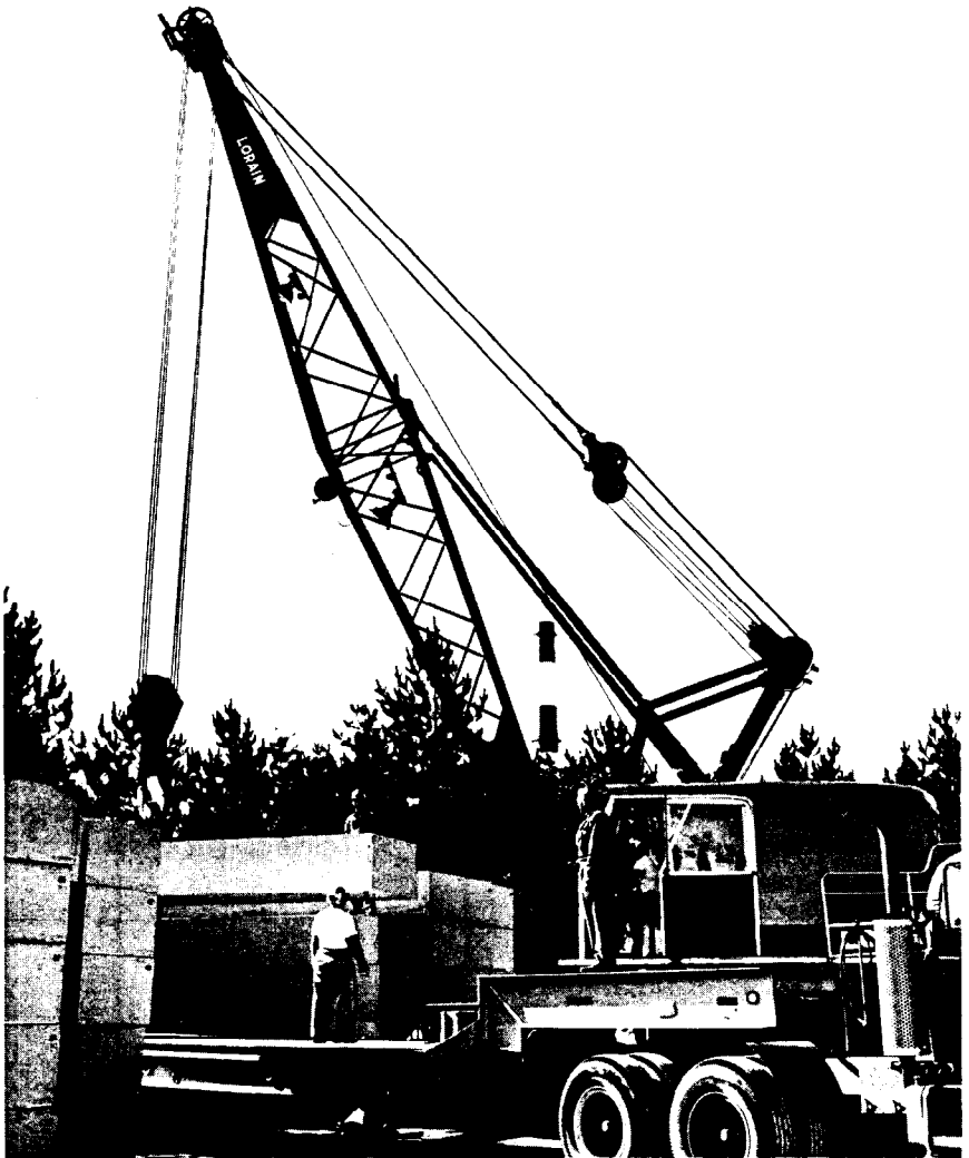
The 80-ton crane loading shielding blocks

The Grounds Maintenance Group of the Plant Maintenance Division consists of approximately seventy-five individuals whose widely varying skills contribute toward the efficient functioning of the Laboratory. The group's several sections include; grounds, sanitation, rigging, and heavy equipment. Headquarters are located in a group of buildings on West Princeton Avenue. Motor repair, winterizing of Laboratory vehicles, and upkeep of heavy machines are handled in one building. Other buildings are used for storage of machinery, including tractors, plows, concrete mixers, bulldozers, graders, rollers, road sweepers, and bucket loaders. Group offices are also located in this area.