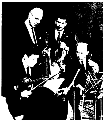
The Juilliard String Quartet

The Juilliard String Quartet will open the 1962-63 BERA Concert Series on Tuesday, October 23, at 8:30 p.m. at the Brookhaven Center. The program will include works by Beethoven, Bartok and Mozart.