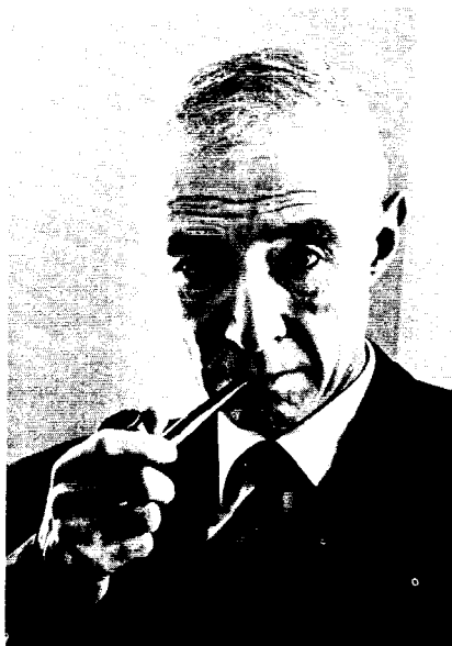
Dr. J. Robert Oppenheimer

Dr. J. Robert Oppenheimer, Director of the Institute for Advanced Study, is the 1963 George B. Pegram Lecturer. His lecture series, entitled Niels Bohr and His Times , will be given as follows: