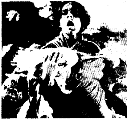
SERGEI EISENSTEIN, Director

Thursday, Oct. 31 - 8:30 p.m. - Lecture Hall