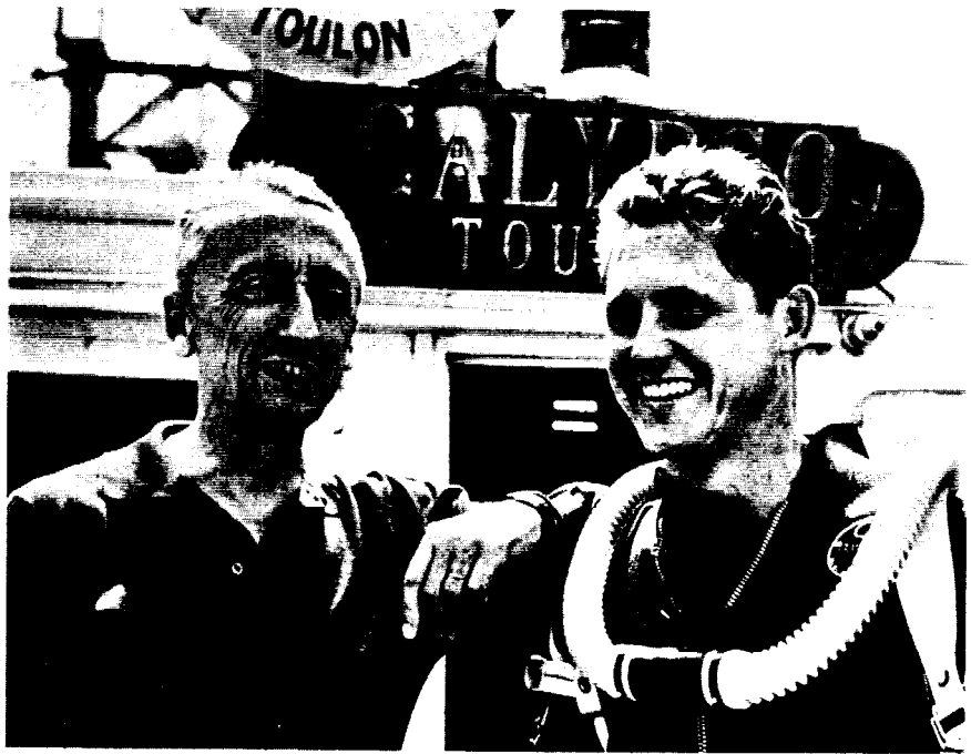
Captain Cousteau and Owen Lee on board the Calypso.

1962 MERCURY - Colony Park, 9 pass. wagon. Auto. trans., power steering, r&h, padded dash, luggage rack. Excellent cond. Ext. 2709.