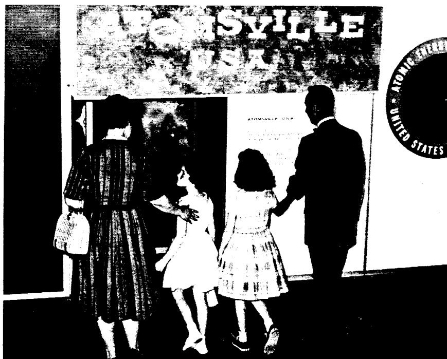
Visitors at the A.E.C.'s World's Fair exhibit.

An "atomic playground" designed exclusively for children opens today at the World's Fair. Entitled Atomsville U.S.A., it is one of the two major components of the Atomic Energy Commission exhibit in the Fair's Hall of Science. As their children visit Atomsville, parents may watch them through one-way mirrors and on closed-circuit television, or they may browse through the nearby second section of the Commission display, Radiation and Man, which was created especially for adult audiences.