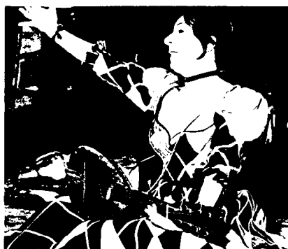
The Golden Coach

media dell'arte troupe which comes to a Spanish province in South America in the eighteenth century.