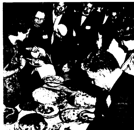
The line forms to the right for those sampling the delicacies offered by our Cooking Exchange Group at their annual dinner which was held at the Brookhaven Center on June 30.

Those of you who have already ordered and/or paid for your books may pick them up at the Recreation Office.