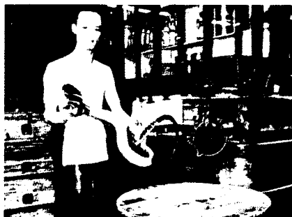
MONDO CANE (Starting at 8:30 p.m.)

Thurs., Aug. 26 — Lecture Hall — 8:30 p.m.