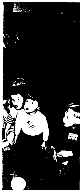
ners look on.