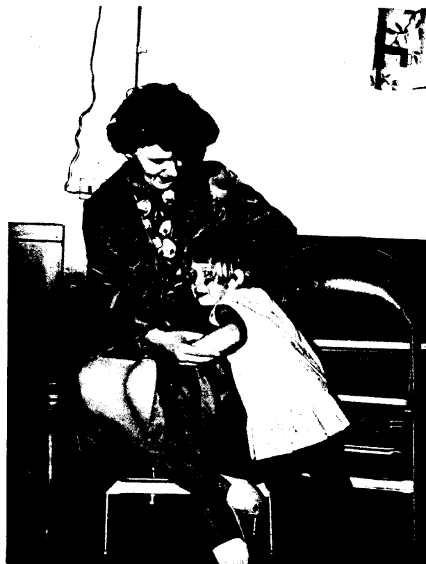
Cryin' the First Day Blues.

After the first week of operation the Upton Nursery School has completed its shakedown and is set to go. Forty-one children speaking at least seven different languages meet three times a week in the Rec Hall.