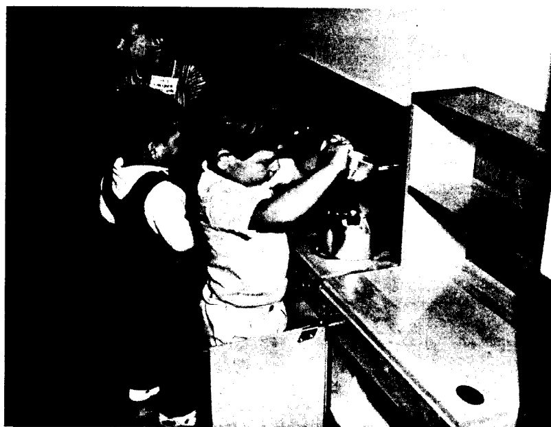
SCHOOL'S GOURMET CLUB discusses what will be on the menu for the mid-morning snack. It turned out to be Bollinger Fruit Juice '65 and cookies a la maison.