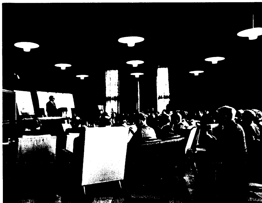
AT BROOKHAVEN CENTER - The AEC site inspection team hears BNL representatives present the Lab as the location for the 200-BeV accelerator.

Commissioner Dr. Glenn T. Seaborg and eight other top-level AEC executives heard a Lab spokesman say that if the proposed 200-BeV accelerator were built using the AGS as the injector, some $60 million could be shaved off the estimated $300 million construction figure.