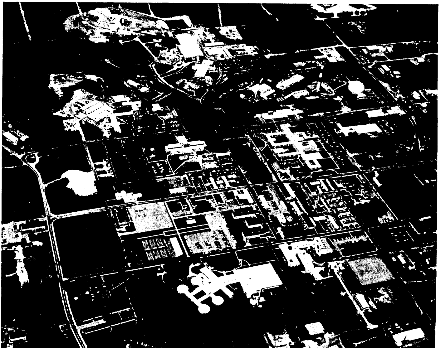
BNL 1966 (below) - The HFBR dome helps to locate the stack. Several new buildings have been added in the past 17 years and the regimented look of an army camp has been replaced by a less-formal university look. Problem: Find three barracks that are in both pictures.