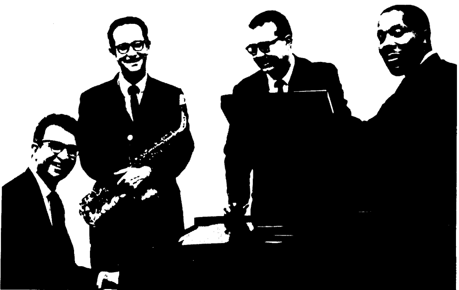
The Dave Brubeck quartet is composed of (left to right) Brubeck, Paul Desmond on Sax, Joe Morello on drums, and Eugene Wright on bass.

Dave Brubeck is the symbol of progressive jazz in the minds of most Americans and also in the minds of people all over the world, even behind the Iron Curtain. When he appeared on the cover of TIME magazine, it was apparent that Dave Brubeck had emerged as one of the few jazz men of any era to capture worldwide recognition.