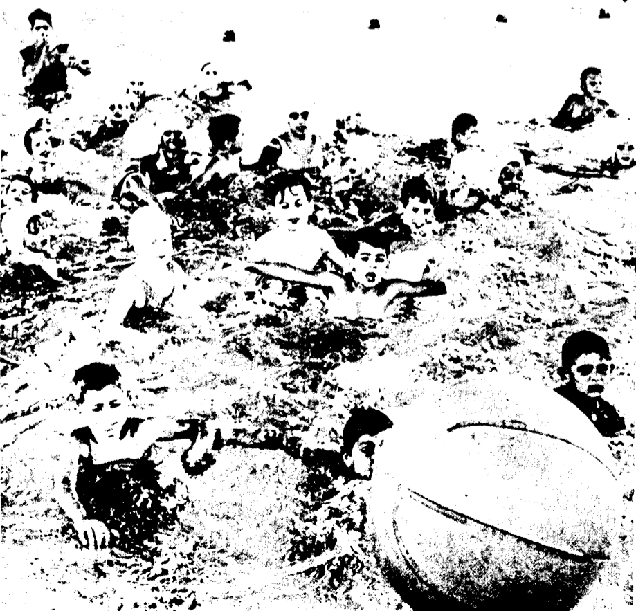
The Children's Summer Swimming Program, which started July 5th, is now under way, as evidenced by the crowd of children shown in the pool. This year about 250 children are registered for the program.