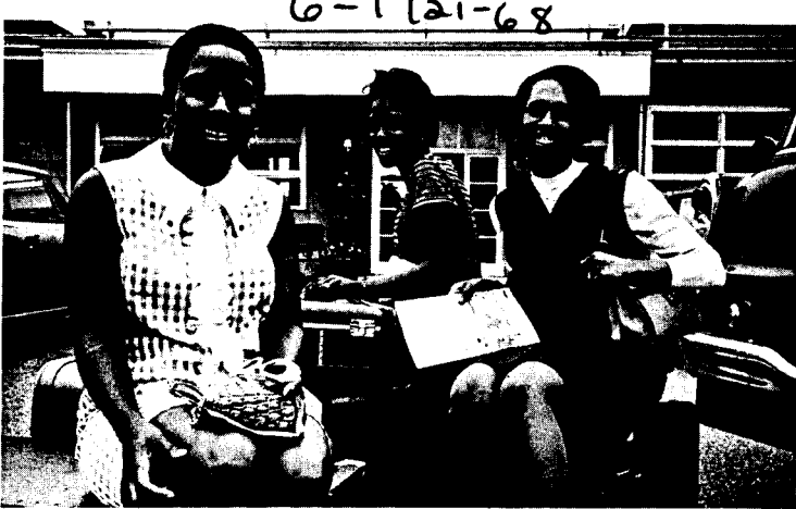
6-1721-68 Students check in at Women's Residence