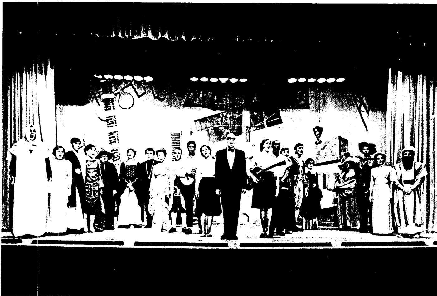
At the request of many members of the enthusiastic audience for "Brookhaven Facade," the complete script has been prepared so that those who couldn't hear or weren't there or just want to remember the words can