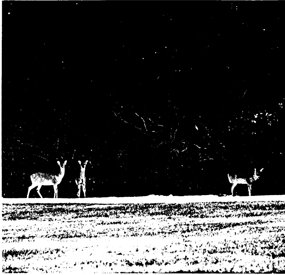
Three of Brookhaven Lab's deer herd watch the cameraman in the field near Security Headquarters. Occasionally a deer will be frightened and run across a road in front of a car causing at the very least a fright to the driver. This is the season to be alert to the movements of deer along Lab roads in the morning and early evening hours. —Humphrey