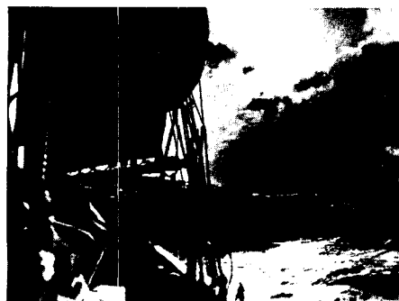
Storm on the Gulf Stream

Two movies shown with the lecture will detail a winter trip from Newfoundland,