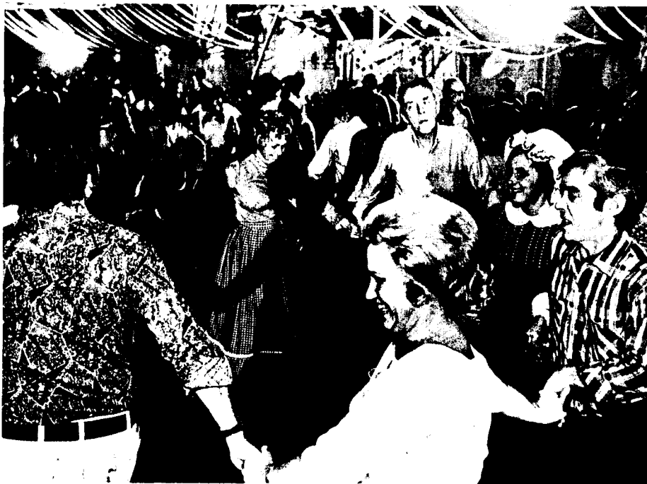
"All go left!" says the caller as one of the popular square sets gets under way.