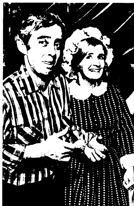
Dressed up for the occasion and ready to dance are these happy people.