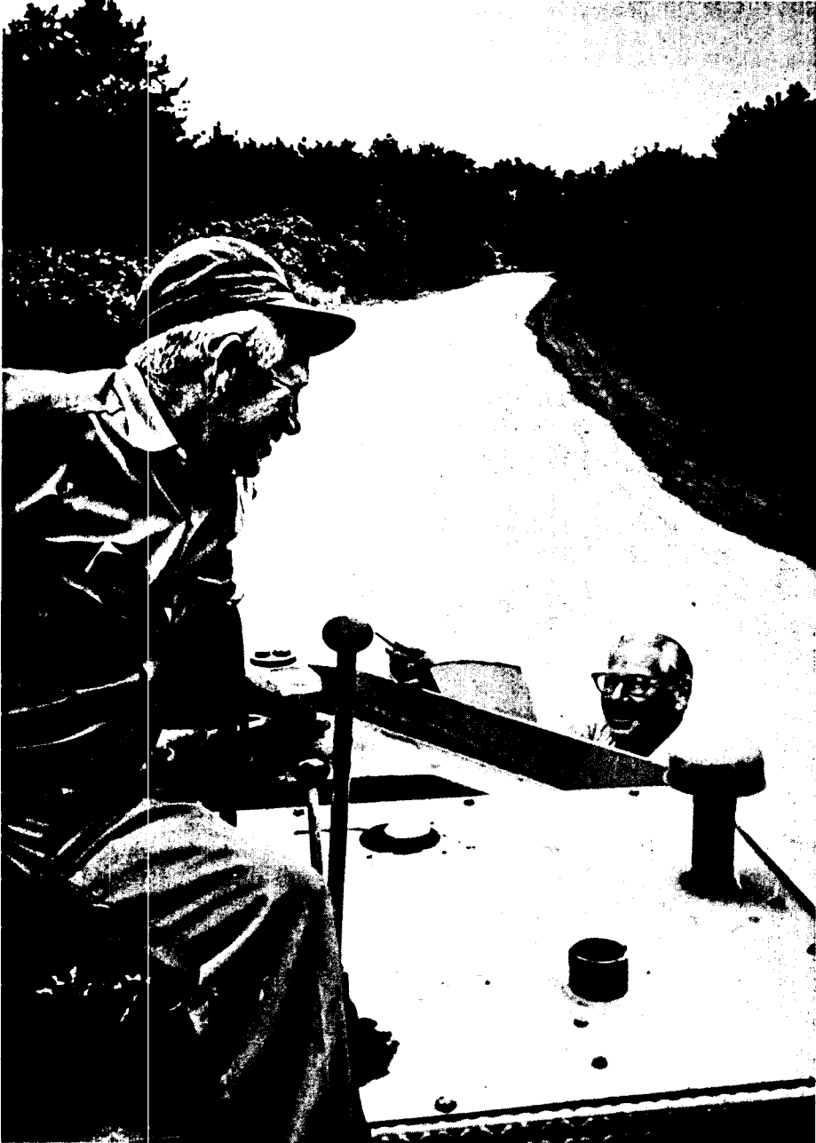
In preparation for the start of operations this fall, the road from the southeast corner of the Lab has been surfaced with crushed stone so that scavenger trucks can get to the Lab sewage disposal plant with liquid effluents used in the spray irrigation project. Bud Van Valkenburgh (on road roller) and George Wagner, both PE&P, worked on road section adjacent to the Biology Control fields.