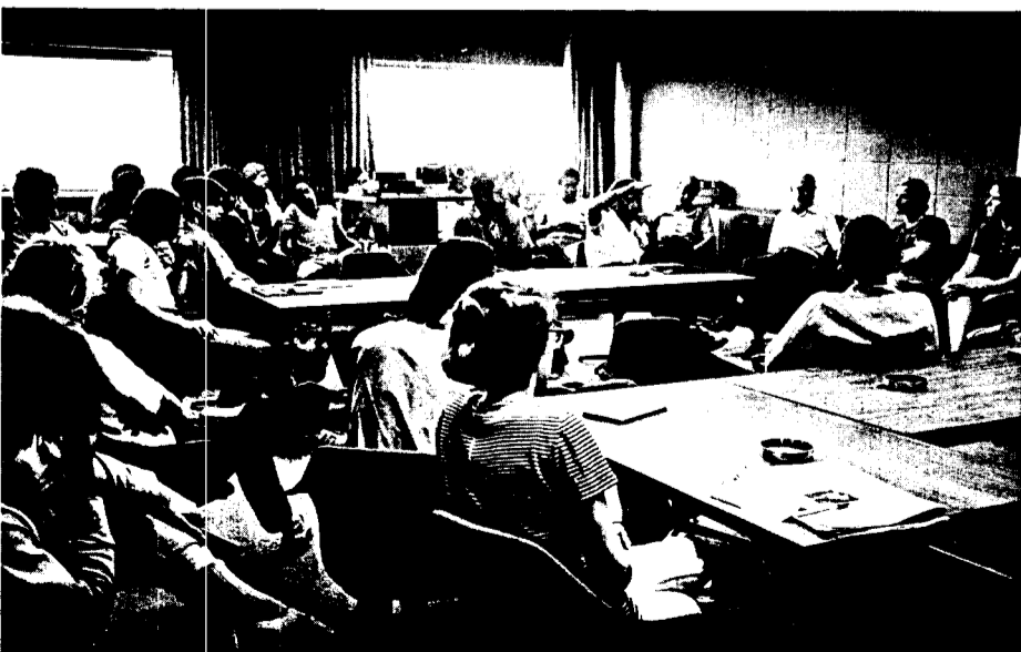
After touring some of the Lab's facilities, the Cornell students met with BNL students working in Biology, Chemistry, and Medical. The BNL students discussed their individual research projects and then listened as the visiting students explained their summer research projects at Cornell.

The fate of Building 117 was sealed, and it gallantly fell to the forces of a wrecker on that warm August afternoon.