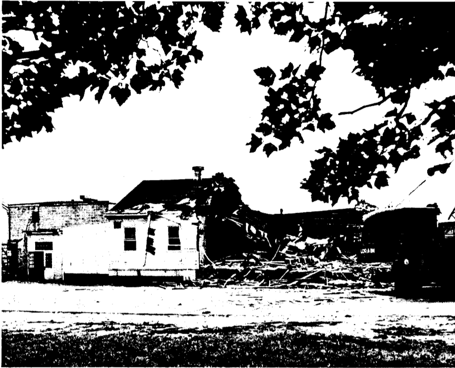
Green grass will replace the crumbled wastes of Building 117, which was torn down a week ago.