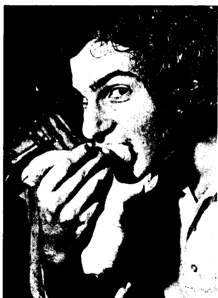
Two BNL summer students enjoy their hot dogs, which were on the menu at the picnic-dinner they had for the visiting Cornell students.