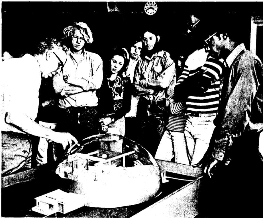
Sixteen biochemistry students on an NSF program at Cornell this summer visited Brookhaven for two days last week.