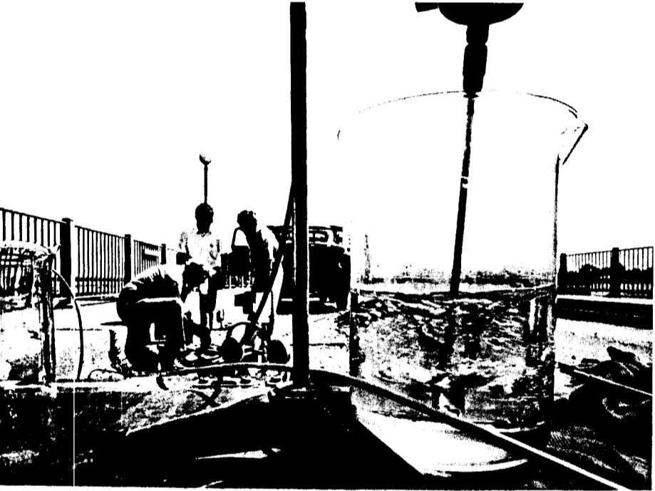
While the monomer is mixing in the back of a BNL truck, DAS men prepare the road surface for the application of the patching material. Jim Klein, Tony Romano and Jack Fontana get ready to install the concrete polymer.