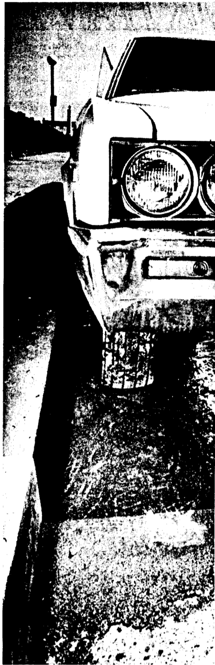
An hour after finishing the road patch it is hard enough to allow traffic.