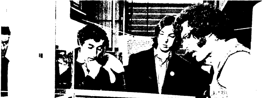
5000 interested visitors turned out Saturday to attend BNL's annual open house. Between high school students and the general public, a combined total of 8400 people came this year to learn about the facilities, research, and people of Brookhaven.