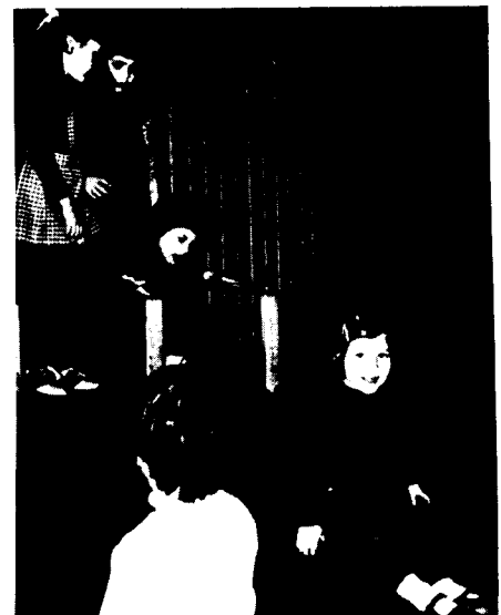
. . . or "let off some steam" on the slide.