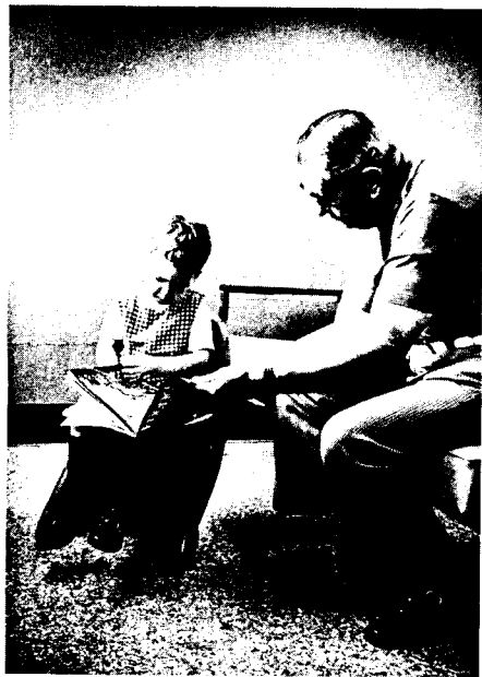
Relatives wait while patient is admitted.

In the past, research patients coming to BNL on an outpatient basis for examination to be admitted to the Hospital, shared the waiting room in the Industrial Medicine Clinic with BNL employees. Although research patient visits are scheduled, most visits to the Industrial Medicine Clinic are not, with the exception of annual employee physicals. Therefore, there was no way of