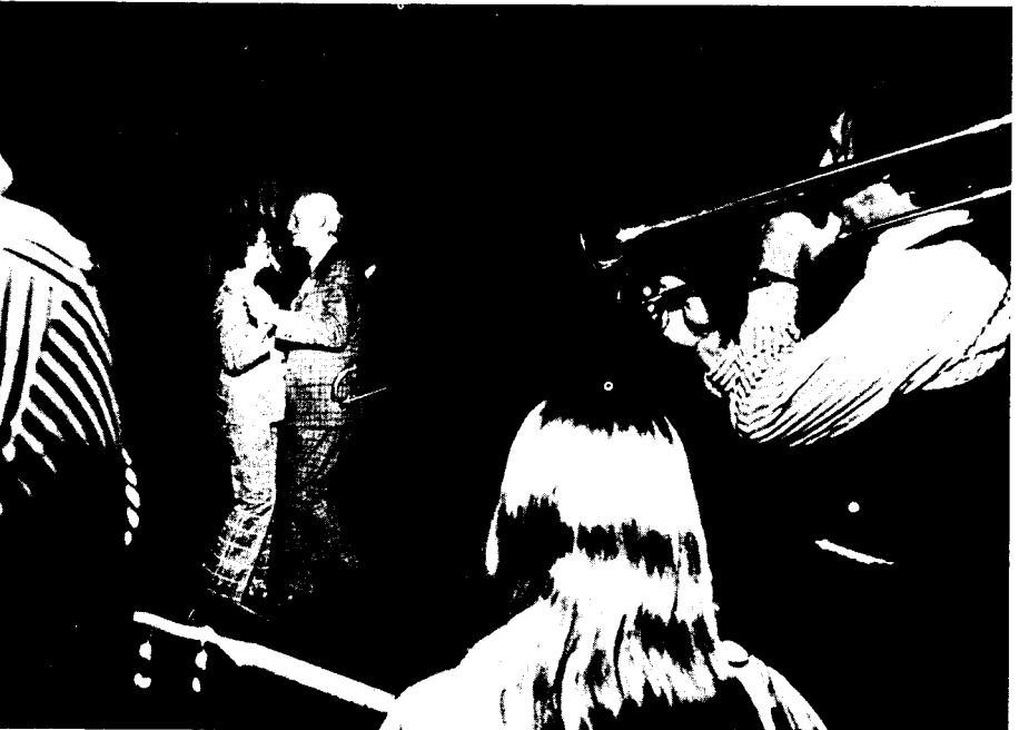
Twenty-eight employees were guests at a party last week at the Center. The occasion was their 25th anniversary at the Laboratory and it was marked by dancing and good cheer.