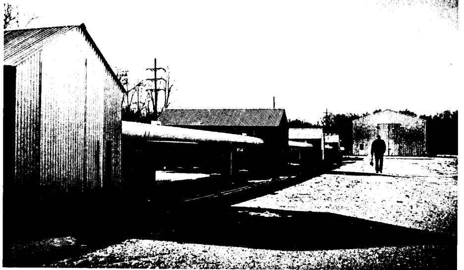
Cryogenic enclosure for superconducting cable stretches across the Fifth Avenue site.