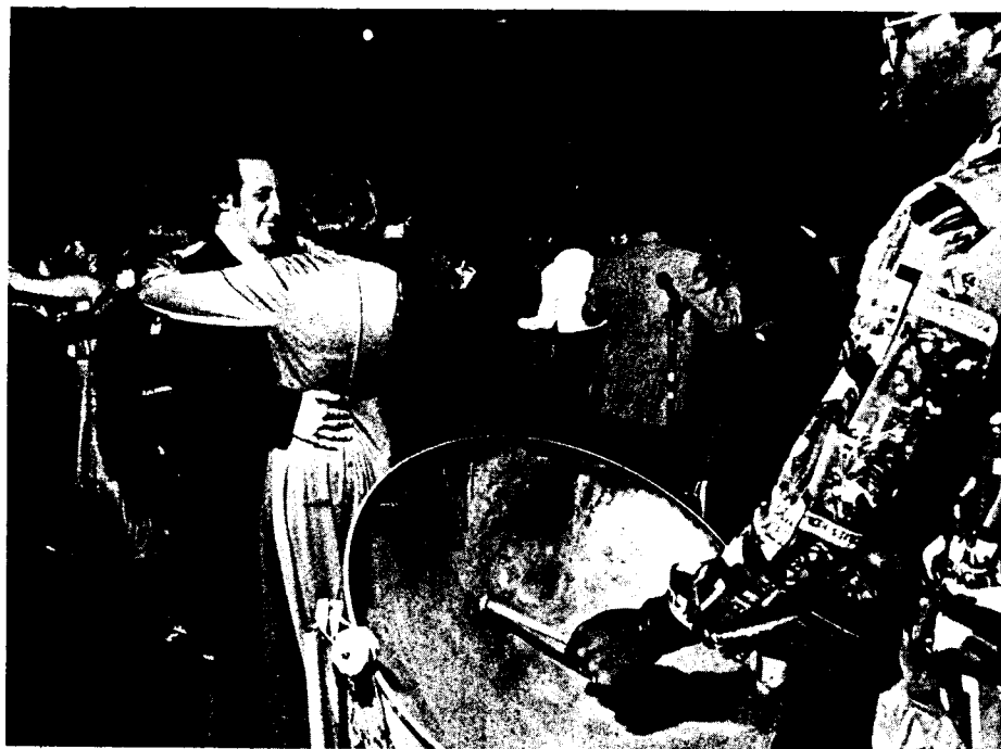
Dancing 'till 1 a.m.

A limited number of smoked hams (bone-in) are now available from the Cafeteria. Give yourself a holiday and leave the cooking to Saga Foods. Call Ext. 3541. Price: $1.59 per pound.