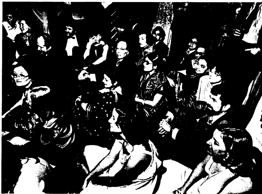
An international audience.

Saturday night saw a capacity crowd at the Center for the Second Annual Winter Cricket Ball. Last year's grand premiere had set the tone, and there was equal elegance this year. In the foyer, guests were received by members of the Cricket Club. The Guest Register was there to be signed and blooms were handed to the ladies.