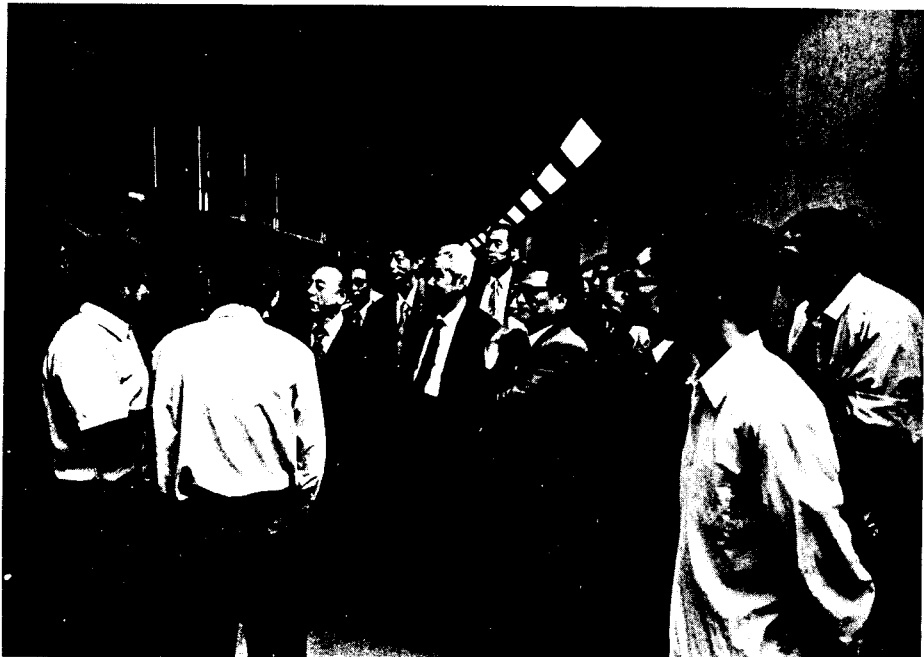
Chinese delegations at the AGS during visit to BNL.