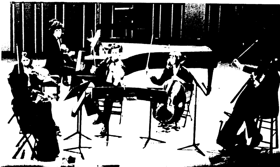
The Music Project

Tickets may be purchased at the door on the night of the concert. General admission is $7; students and senior citizens, $4; and those under 18, $3.