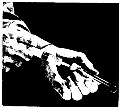
Blood sample being drawn out of an instant kit for labeling red blood cells.